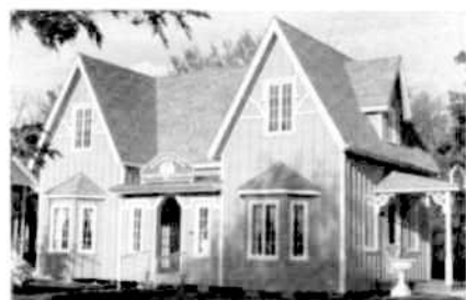
The Photo Parlor was built in 1977.